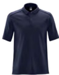
M's & W's: Navy/Navy