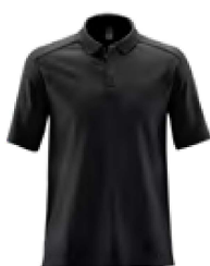
M's & W's: Black/Dolphin