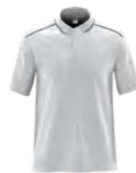
M's & W's: White/Dolphin