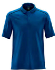
M's & W's: Azure Blue/Black