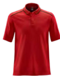
M's & W's: Bright Red/Black