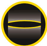
INTERNAL KNEEPAD POCKET