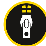
BRASS YKK ZIP LIFETIME WARRANTY