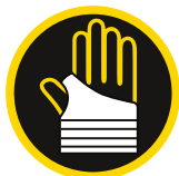
ELASTICATED CUFF WITH THUMBHOLE