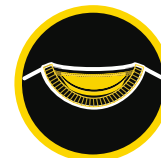
HALF MOON YOKE