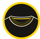
TAPED NECKLINE FOR COMFORT