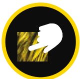
LUXURIOUS FAUX FUR LINING