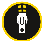
YKK ZIP LIFETIME WARRANTY