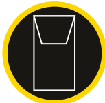
MOBILE PHONE POCKET ON CHEST