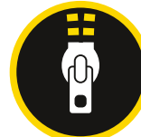
FULL FRONT ZIP WITH STUDDED STORM FLAP