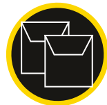
TWO LOWER POCKETS WITH HOOK AND LOOP FASTENING FLAPS & HAND WARMERS