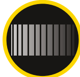
ELASTICATED HIP DETAIL WITH LONGER BACK PANEL