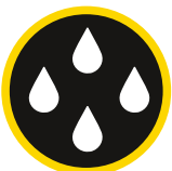
WATER RESISTANT FABRIC