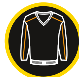
REFLECTIVE PIPING ON CONTRASTING ARM PANELS