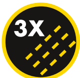
TRIPLE STITCHED SEAMS