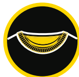
HALF MOON YOKE